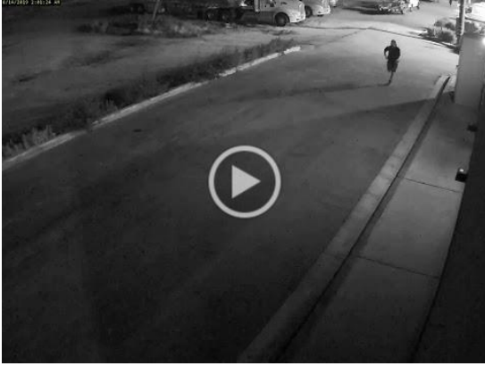
Figure 2: A Segment of surveillance camera footage from a nearby business

warranted. A Grand Jury also allows for witnesses who were uncooperative with the criminal investigation to be compelled under subpoena to testify. Ultimately, the office felt it appropriate for a Grand Jury, comprised of members of the community, to determine if the actions of the officer were reasonable under the circumstances. Under California law in effect at the time, a police officer may utilize deadly force if the officer had probable cause to believe that the suspect posed a